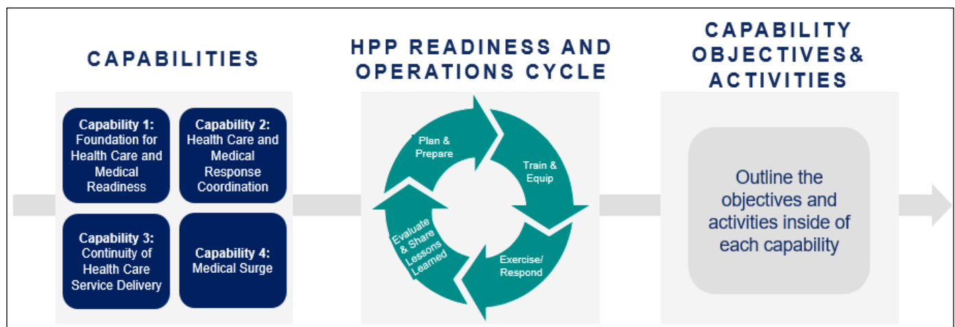
Figure 1. HPP FOA Structure

Ideally, work plan activities under each phase will correspond to quarters in each fiscal year (FY). In quarter one, activities would focus on planning and preparing. In quarter two, activities would focus on training and equipping. In quarter three, activities would focus on exercising, and in quarter four, activities would focus on evaluating and sharing lessons learned. While responses are the optimal tests of plans and training activities, these naturally occur at any point in the cycle—when disasters strike—and should be followed by the evaluation, planning, and training phases based on lessons learned from each response.